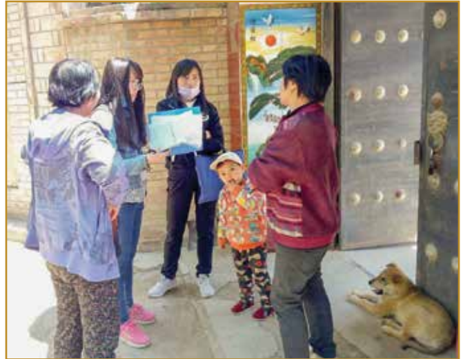
Ningxia Medical University's investigators interviewed community residents about mental health services in Ningxia Hui Autonomous Region.

research group. The problems addressed include non-communicable diseases, air pollution, aging, migrant health, and bioethics; and the policies under development include those addressing neglected diseases, health systems performance, financing, human resources, and essential drugs.