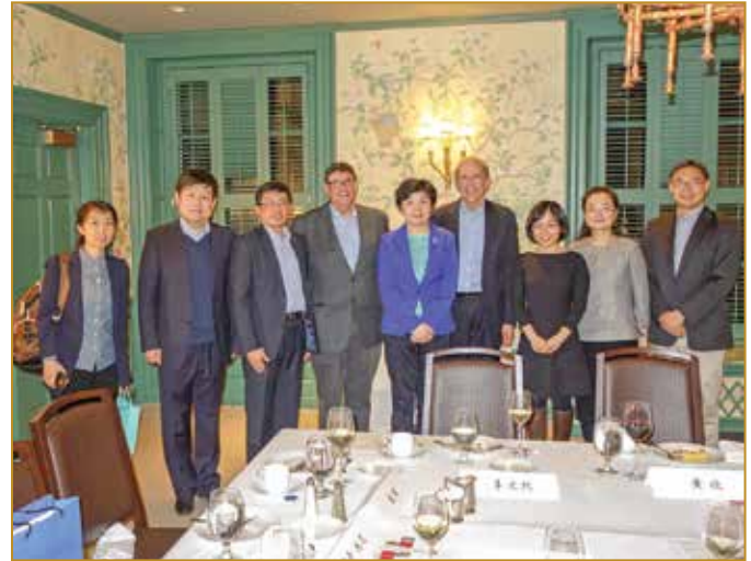
CMB hosted a roundtable discussion with Vice Minister of Health Cui Li (center) and a delegation from the National Health Commission during their 2017 visit to the Boston area.

CMB also supports advocacy for global health in China. CMB and Peking University Health Science Center cohosted a Global Health Forum in October