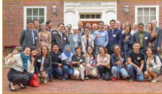
2018 Fellows during the Global Learning week at Harvard.

From 2016 to 2018, there were 3 cohorts, for a total of 56 Fellows, drawn from 11 countries and