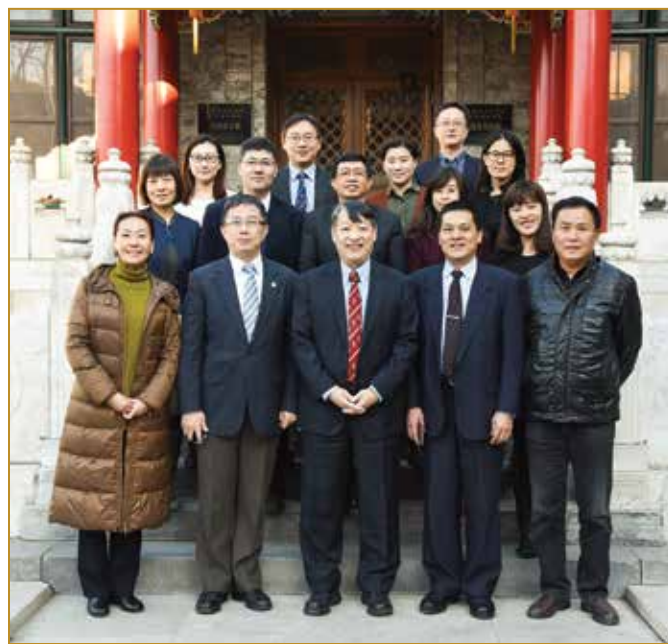
CMB Liaison officers, pictured here with CMB staff, play key roles in facilitating CMB's relationships with medical universities.

Over the course of a decade of support, CMB's strategy has been to build individual and institutional leadership in the HPS field and create connections between China's emerging HPS community and global networks (see diagram on page 9). CMB also recognizes that attracting talent to HPS and building up leadership