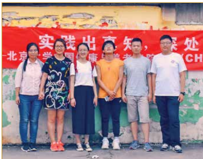
One of the interview teams for the China Health and Retirement Longitudinal Study (CHARLS), which collected survey data in Henan Province for a project on healthy aging.

China’s health system is hospital-centric, fragmented and volume driven. Service delivery has a strong bias toward providing more treatment rather than improving population health outcomes and toward serving more people at hospitals rather than at grassroots levels. Health financing needs better integration and insurance