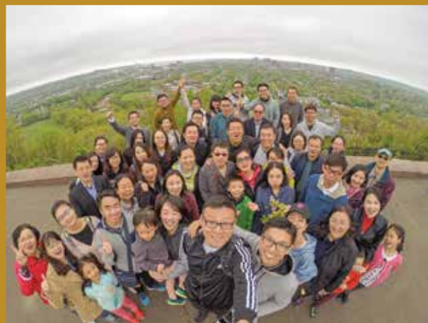
2018 CHPAMS members enjoy a team-building hiking after the organization’s second biennial conference held at Yale University in May 2018.