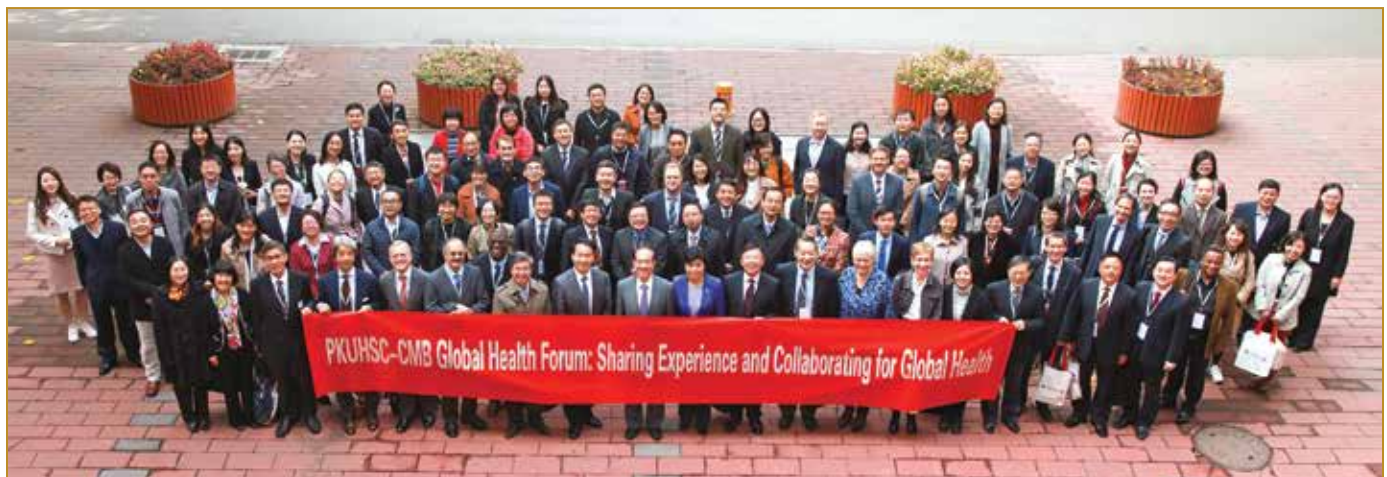
Peking University Health Science Center joined by CMB convened a global health forum on "Sharing Experiences and Collaborating for Global Health" on October 23-24, 2017, attended by 130 Chinese policymakers and health professionals and international scholars.

2017, which brought together leading researchers for a discussion on global health strategies. In April 2017, CMB hosted a roundtable discussion on global health in its Cambridge office during the U.S. visit of Chinese Vice Minister of Health Cui Li.