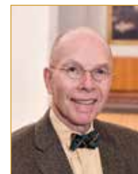
Jeffrey P. Koplan Vice President for Global Health, Emory University Director, Emory Global Health Institute