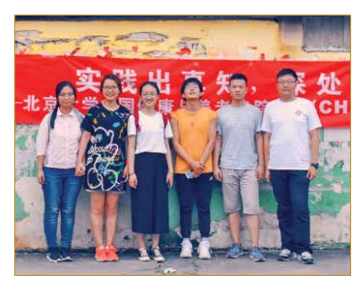
One of the interview teams for the China Health and Retirement Longitudinal Study (CHARLS), which collected survey data in Henan Province for a project on healthy aging.

China's health system is hospital-centric, fragmented and volume driven. Service delivery has a strong bias toward providing more treatment rather than improving population health outcomes and toward serving more people at hospitals rather than at grassroots levels. Health financing needs better integration and insurance