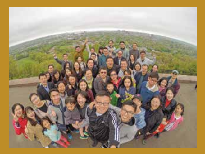
2018 CHPAMS members enjoy a team-building hiking after the organization's second biennial conference held at Yale University in May 2018.