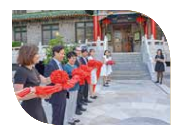
CMB WELCOMES FRIENDS TO NEW BEIJING OFFICE SEPTEMBER 10, 2016

Asia Trek 2016 brought Fellows to Thailand and engaged them on the theme of vulnerable populations, especially urban and ethnic migrants.