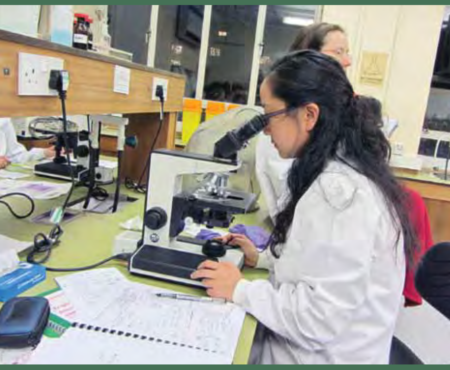
Promoting innovations and rural equity in health professional education in China.