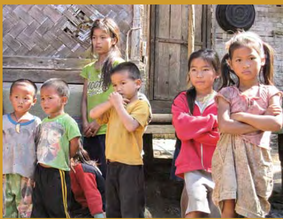
Strengthening health professional education and health policy work in the 5 countries of the Mekong region.